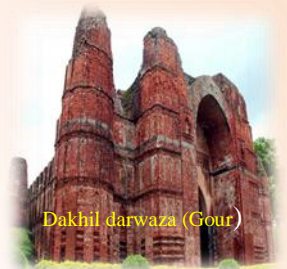
Dakhil darwaza (Gour)

For Detail Information please visit- http://malda.gov.in/place_about.htm