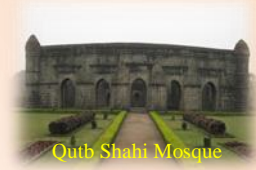
Qutb Shahi Mosque