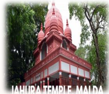
JAHURA TEMPLE MALDA