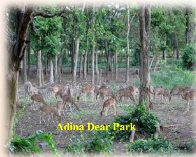
Adina Deer Park