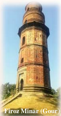
Firoz Minar (Gour)

The word 'Mal' in Arabic means wealth and the name 'Maldah' probably signifies that it was an important center of trade. It holds nearly the central geographical position in West Bengal. Throughout mediaeval periods Pandua and Gour of the district were capital cities of Bengal. Gour and Pandua are almost equidistant north and south from English Bazaar and on opposite sides of Mahananda, Gour being on the west and Pandua on the Eastern. Malda has its rich heritage and colonial history is indeed one of the most cherished tourist destinations of West Bengal. Malda was previously known as 'English Bazaar' and it got its name (English Bazaar) from the English Factory which was established here in 1771. Malda is the chief halt for visiting Gour and Pandua. Gour, capital to three dynasties of ancient Bengal – the Buddhist Palas, the Hindu Senas and the Muslim Nawabs – has seen three distinction eras of glory and has a major share in the history of India. During medieval period Bakhtiya Khilji made his headquarters at Gour and from that centre established Mahomedan rule over the greater part of Northern and central Bengal. After the death of Bakhliyar Khilji, Ghiyasuddin Khilji ruled from 1211 to 1227 A.D. The important places of tourists' interest of Malda district are Gour, Firoz Minar, Dakhil Darwaza, Adina deer park, Adina Mosque, Qutub Shahi Mosque, Jagjibanpur, Baroduari / Boro Sona Mosque and Jahura Kali Temple.